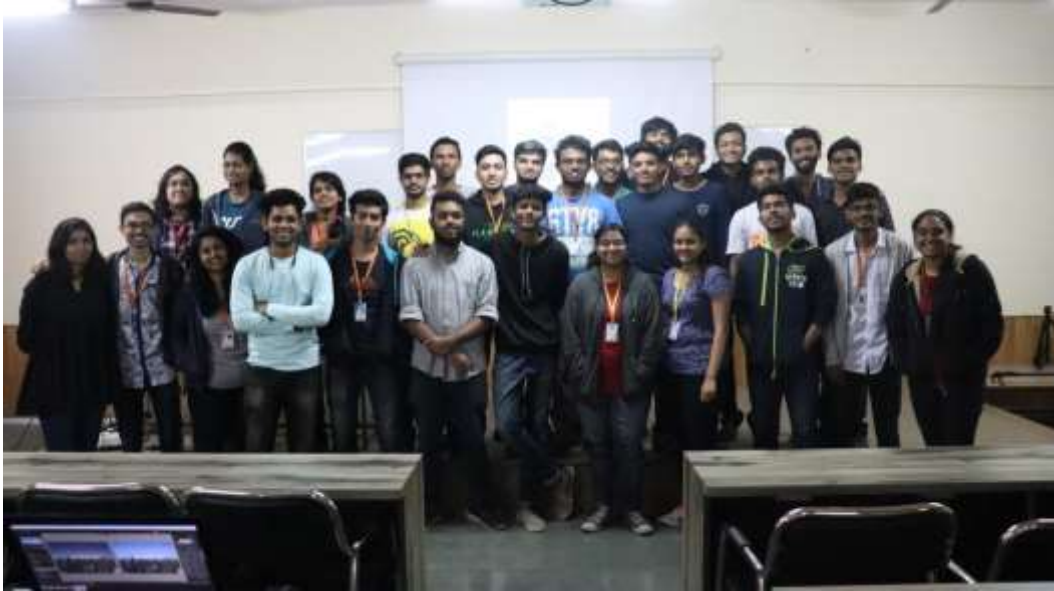
Participant and resource persons of photography and video editing workshop