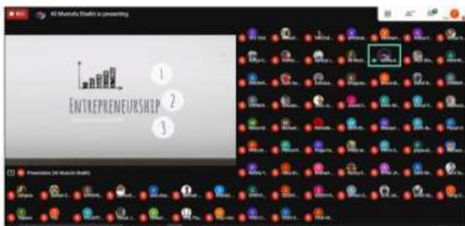
Participants of “Entrepreneurship – A Way of Life” in a Zoom meeting